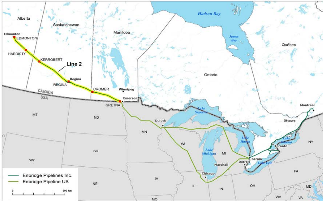
Figure 1: Enbridge Line 2