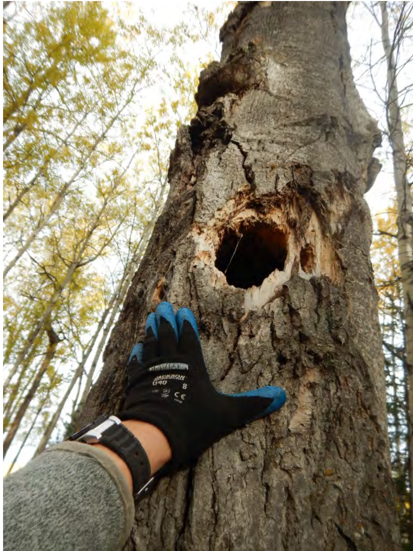
Photograph 27 Wildlife tree with potential nesting cavity near KP 16