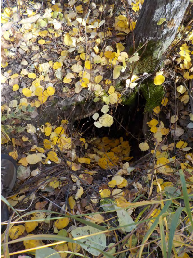
Photograph 29 Potential American marten or Red fox denning or resting site near KP 17