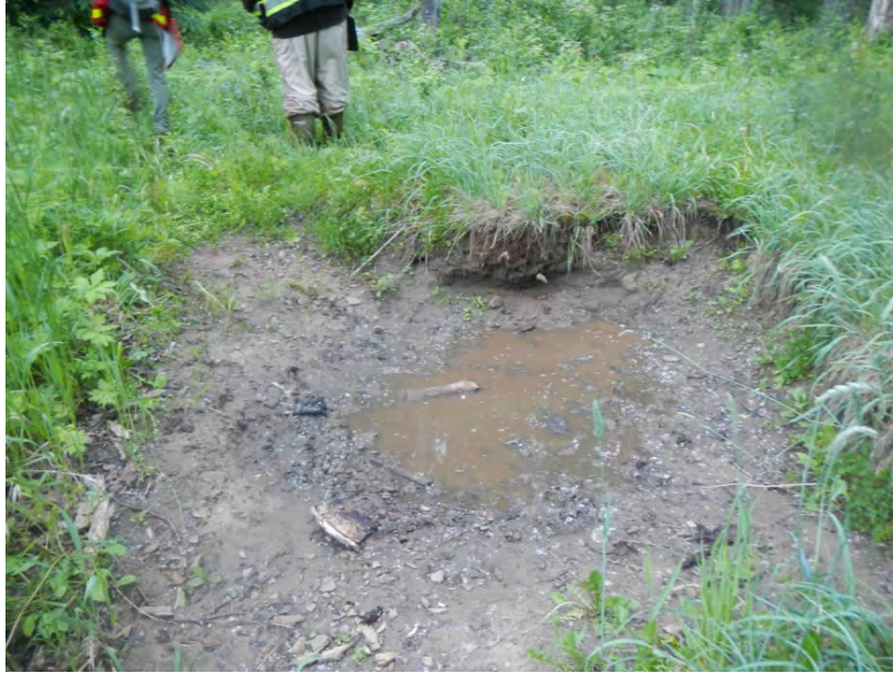
Photograph 33 Small mineral lick near KP 26