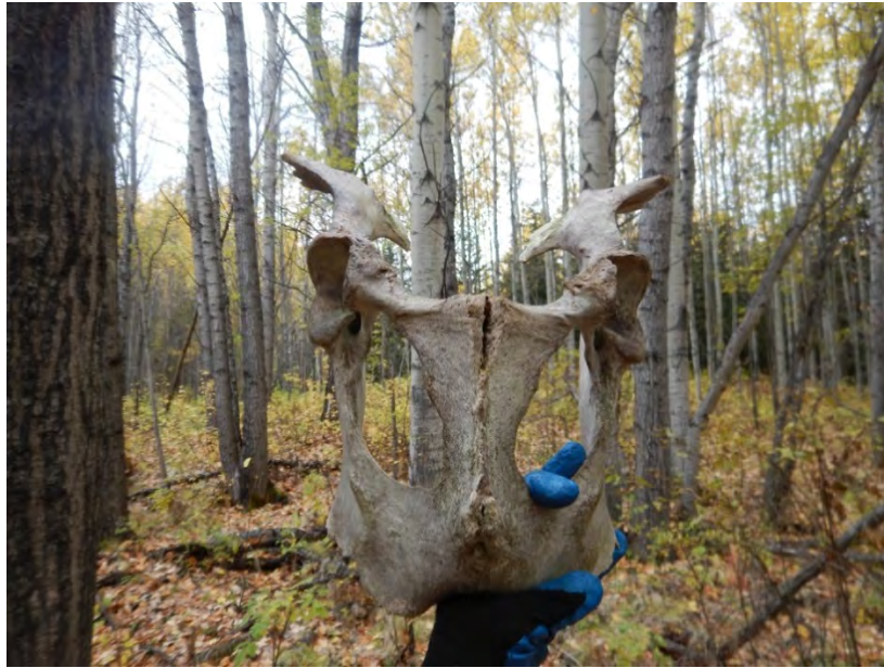
Photograph 28 Moose pelvis found near KP 16