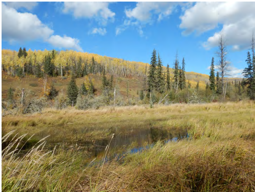
Photograph 4 Wetland habitat near KP 13