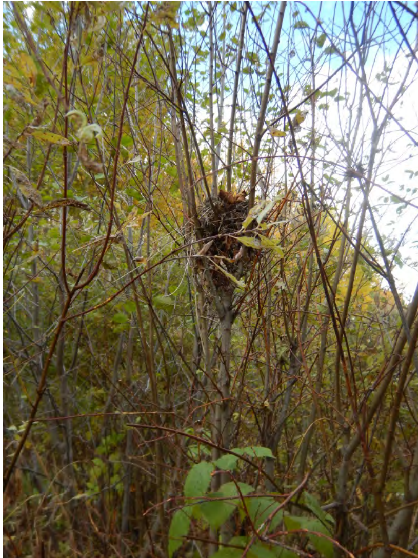
Photograph 32 Inactive songbird nest near KP 22