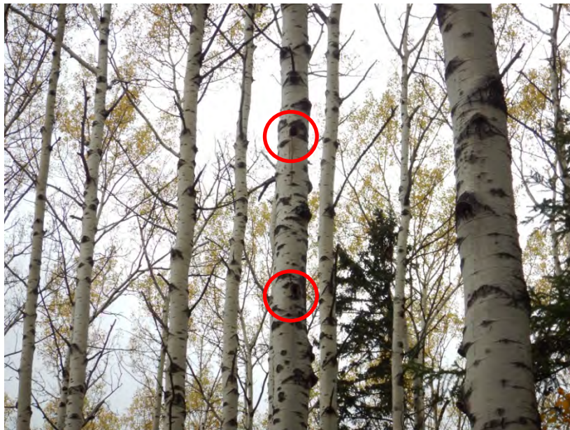
Photograph 19 Wildlife tree with seasonally inactive nesting cavities near KP 1, looking northwest