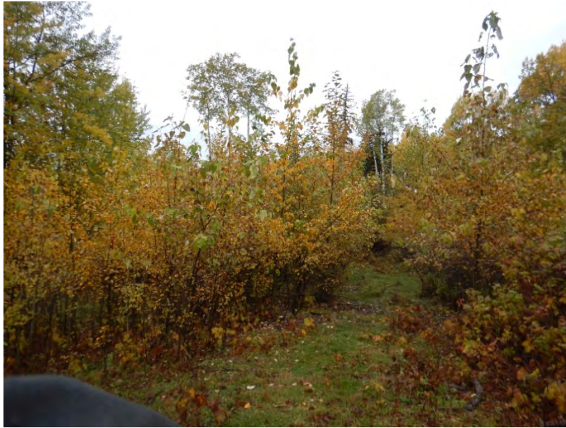
Photograph 5 Tall shrub habitat near KP 4