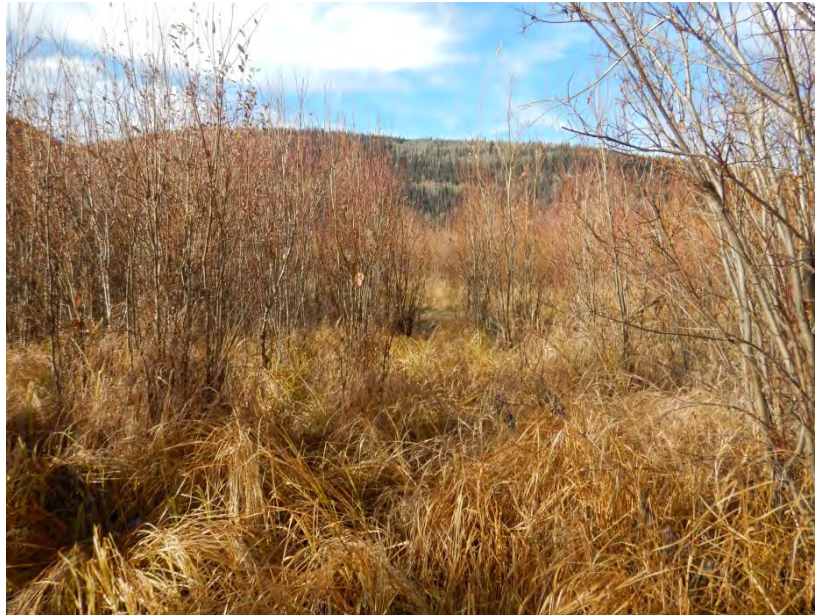
Photograph 18 Potential amphibian breeding habitat near (WHF5)