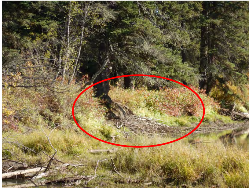
Photograph 25 Beaver lodge near KP 13.5