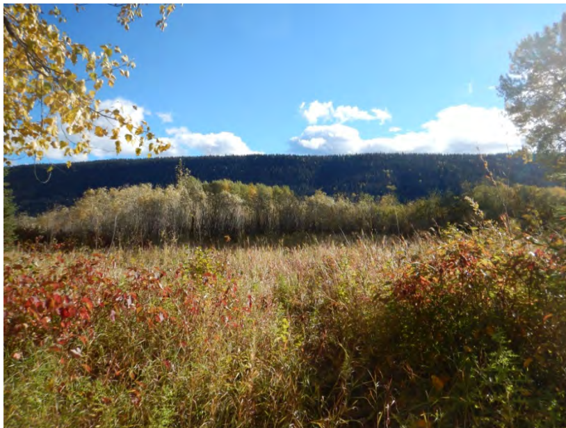
Photograph 6 Low shrub habitat near KP 14