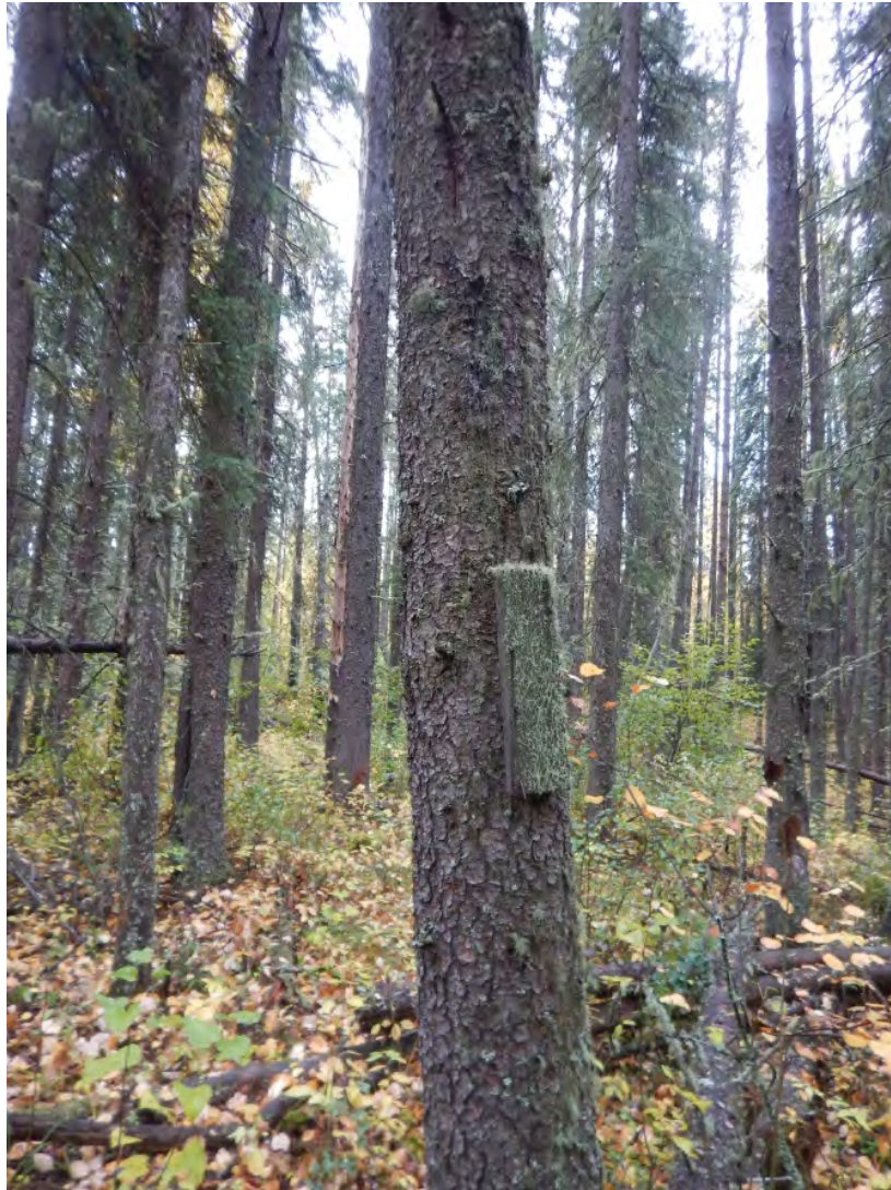
Photograph 22 Remnants of an old American marten trap near KP 5, looking south