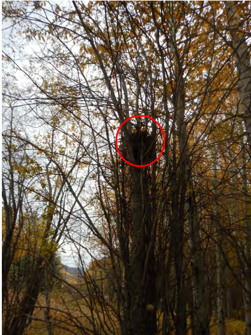
Photograph 30 Small inactive stick nest, likely black-billed magpie near KP 20