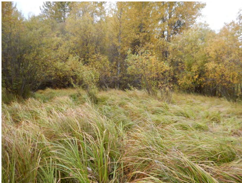
Photograph 15 Potential amphibian breeding site near KP 15