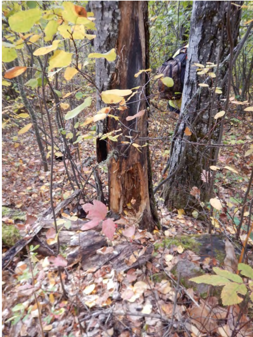
Photograph 20 Wildlife tree with evidence of woodpecker feeding