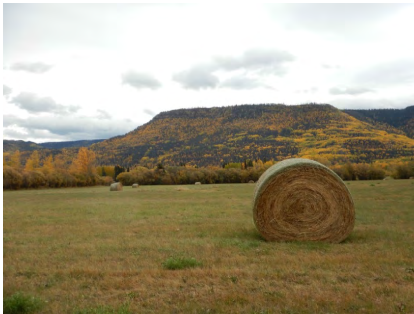
Photograph 7 Pasture near KP 20