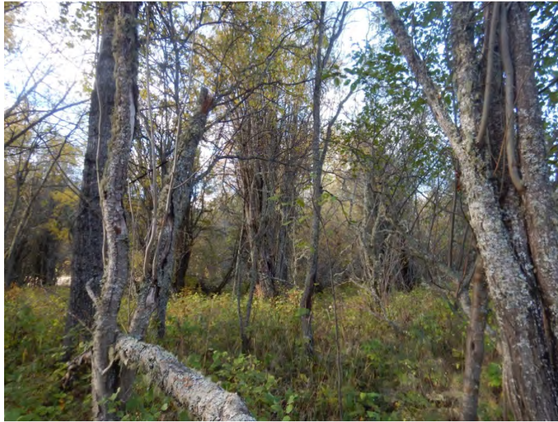
Photograph 16 Potential amphibian breeding site near KP 22