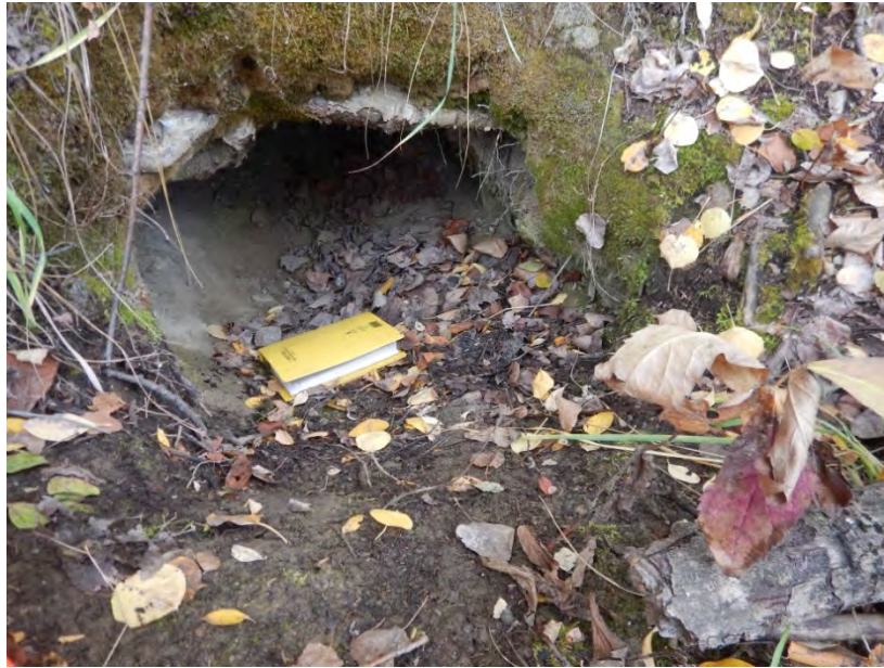
Photograph 9 American black bear den near KP 2.5, looking west