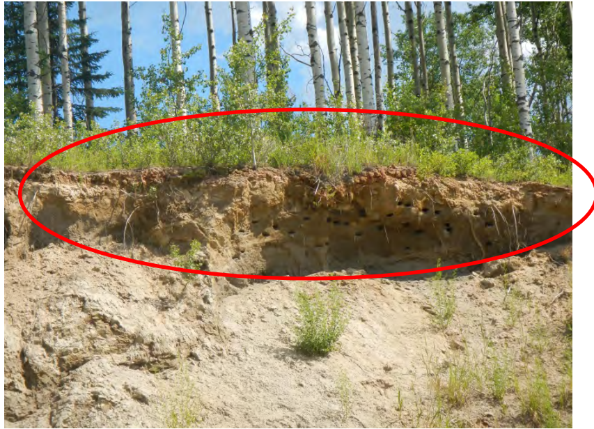
Photograph 12 Potential swallow colony near KP 3.5 looking east