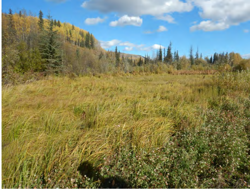
Photograph 14 Potential amphibian breeding site near KP 13, looking northeast