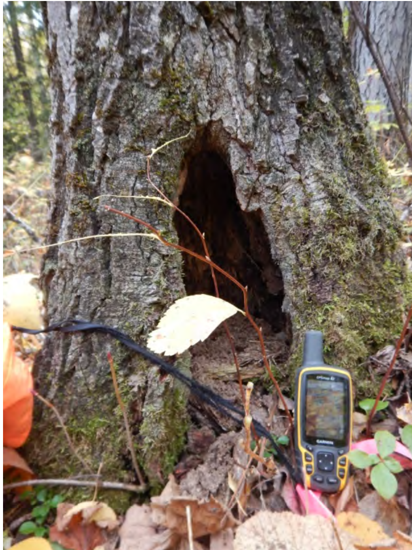
Photograph 21 Potential American marten resting or denning site near KP 2