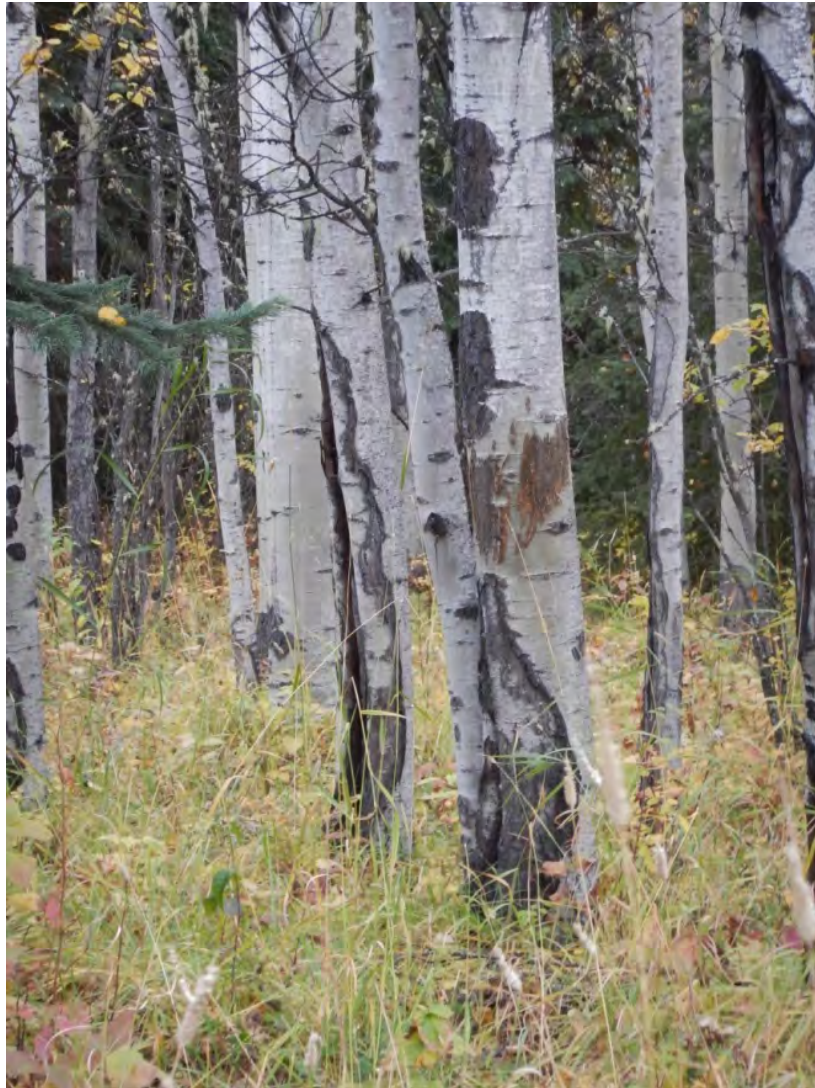
Photograph 24 Antler rubs, likely from a white-tailed deer, near KP 8