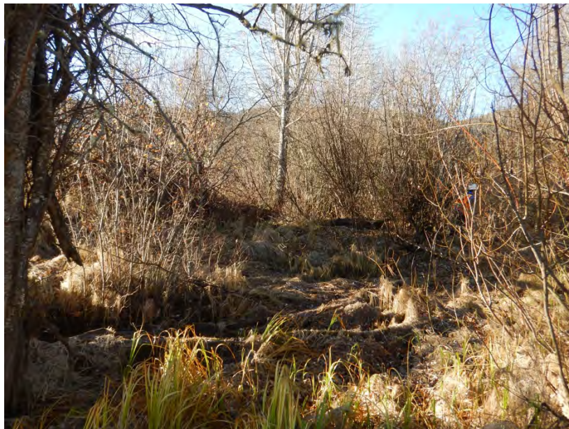
Photograph 17 Potential amphibian breeding habitat in drag site near KP 13 (WHF4)