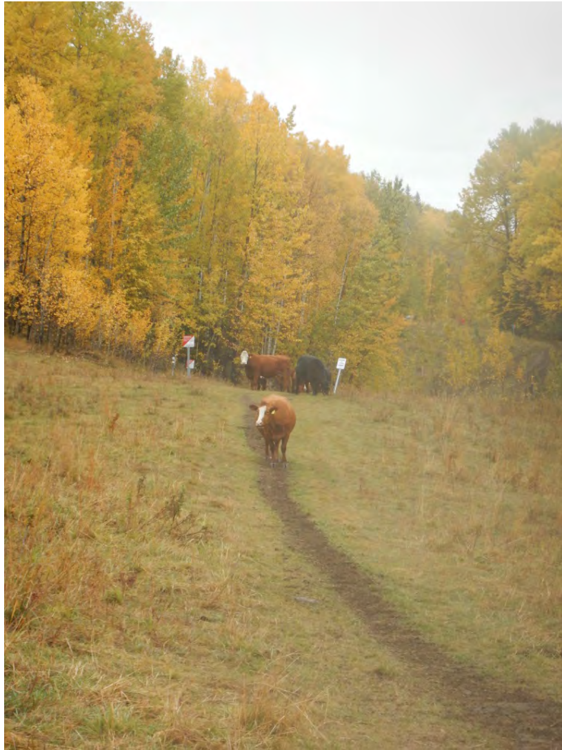
Photograph 8 Cattle in the study area near KP 6