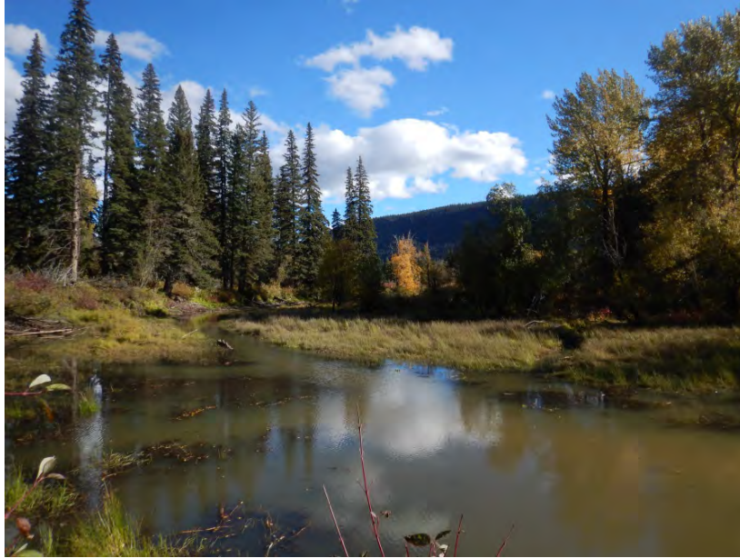
Photograph 3 Riparian habitat at a side channel of the Pine River near KP 13.5