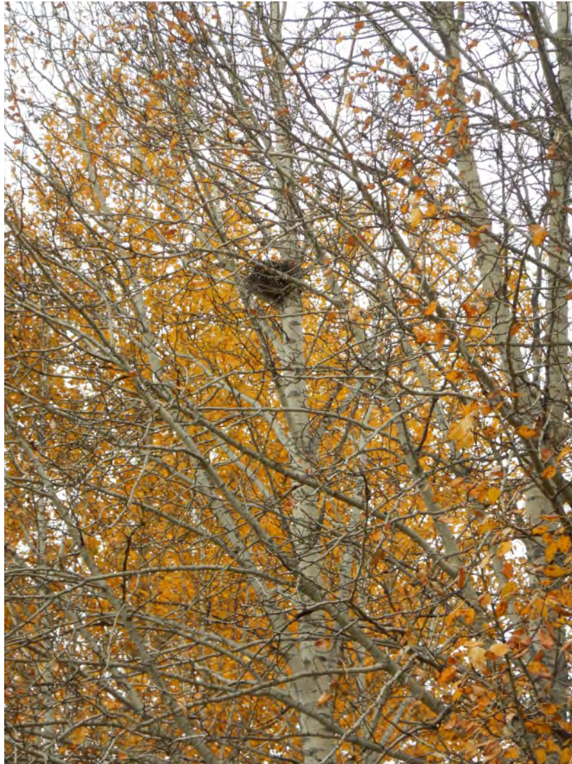
Photograph 31 Small inactive stick nest, likely American crow, near KP 21