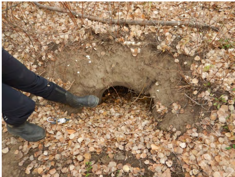
Photograph 10 Potential American black bear den near KP 17