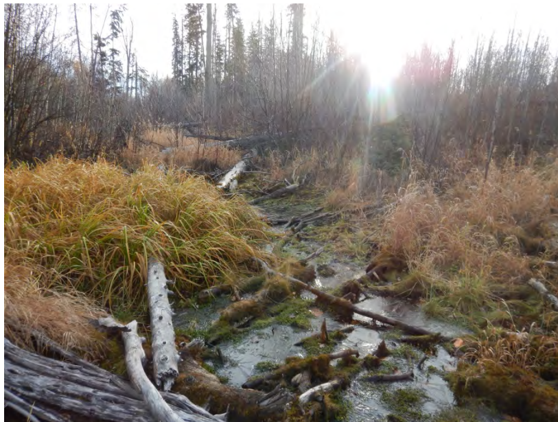
Photograph 13 Potential amphibian breeding habitat near KP 0.5