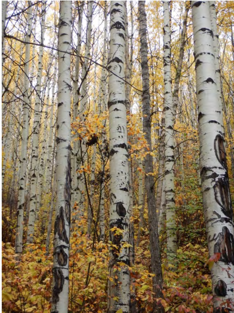
Photograph 23 Trees with antler rubs and scratched by bear cub near KP 5.5