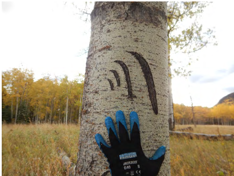
Photograph 26 Bear scratches on a tree near KP 16