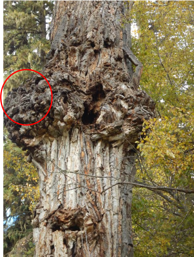
Photograph 11 Potential Fisher den, looking northwest