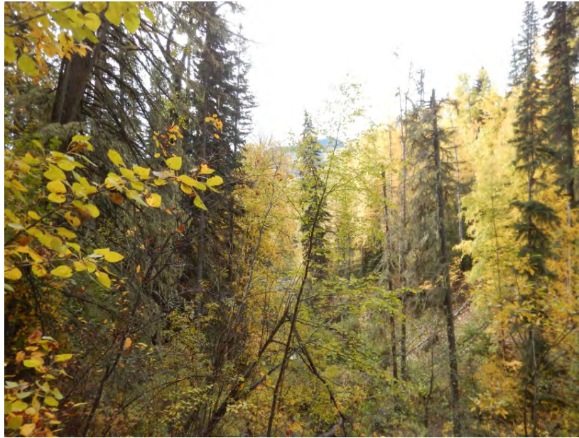
Photograph 1 Mixed-wood open forest habitat near KP 2.5